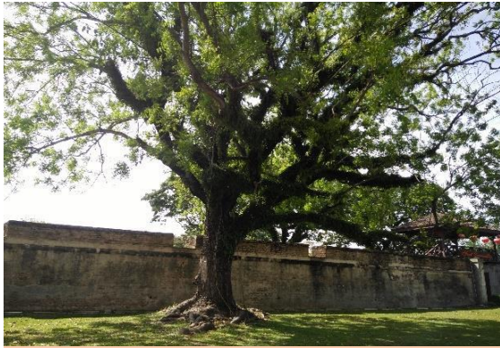
Figure 3.2: Heritage tree located at Fort Cornwallis, Georgetown WHS