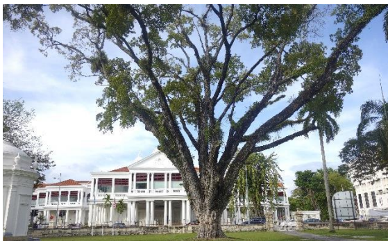
Figure 3.4: Heritage tree located at St George's Church, Georgetown WHS