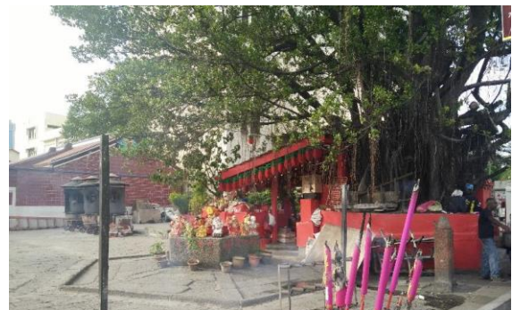
Figure 3.5: Heritage tree located at Goddest of the Mercy Temple, Georgetown WHS