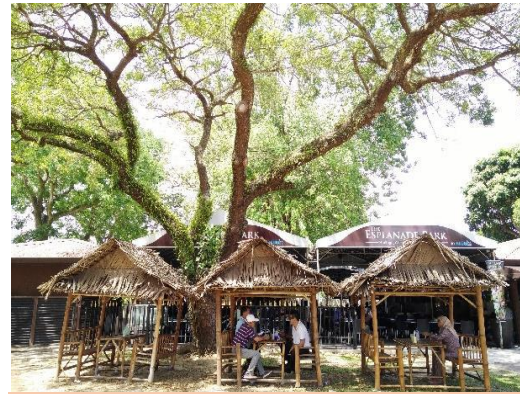
Figure 3.3: Heritage tree located at Padang Kota Lama, Georgetown WHS