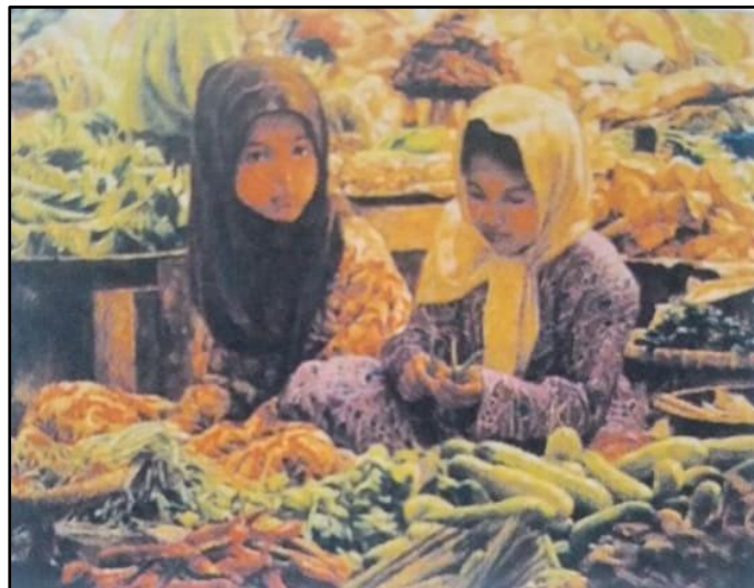
Title: Friday Morning, Artist: Kow Leong Kiang, Media: oil paint on canvas. Size: 95.5 x 121 cm, Year: 1996, Collection of the National Gallery of Art.