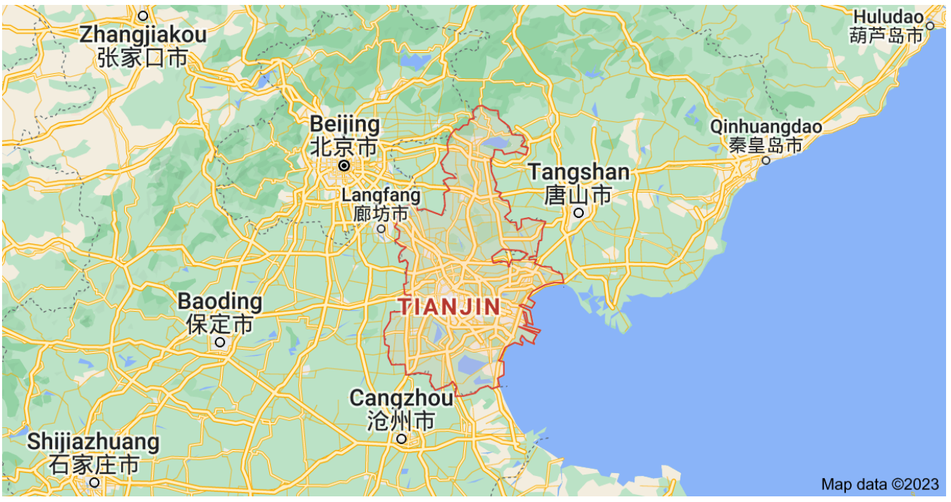
Figure 1: Tianjin Maps

Vol. 14, No. 3, 2024, E-ISSN: 2222-6990 © 2024