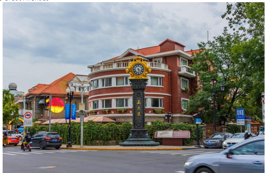
Five Great Avenues

Italian Style Street is more than just a pretty place to look at; it's also a lively centre for art and culture. Visitors can enjoy a wide range of creative and cultural attractions within the buildings' many art galleries, boutiques, restaurants, and specialised shops. Cultural events, exhibitions, and festivals add to the street's already exciting vibe. I gained a deeper appreciation for the value of maintaining and honouring cultural history as a result of my research into Italian Style Street. It emphasises the value of cultural interactions and the longlasting effects of different styles of architecture. The street is a tangible reminder of the importance of cultural interchange in forging a nation's unique identity and of the longstanding ties that have linked China and Italy throughout history.