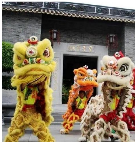
Figure 3: Southern Lion (Guangdong Lion Dance)

In terms of appearance and production, they can be divided into "Heshan lions" and "Foshan lions". The "Heshan Lion" has eyes and jaw corners that are not exposed but still convey a sense of awe. It features a flat, oval mouth, is lightweight yet fierce, and has a slightly shorter tail. The "Foshan Lion," on the other hand, achieves a balance of form and spirit, closely resembling the real animal. It is characterized by finely shaped eyebrows, large eyes that can move, a wide mouth with protruding lips, an apricot nose, visible teeth and tongue, prominent cheeks, a high but narrow jaw, a full forehead, and a slightly shorter tail. The main difference between the two lies in the lion's head. The Foshan lion's head (Figure 4) is much larger in proportion to its body, earning it the nickname "big head lion." It features a forehead similar to that of the God of Longevity, broad and protruding, commonly referred to as