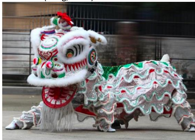
Figure 4: Foshan mounted lion