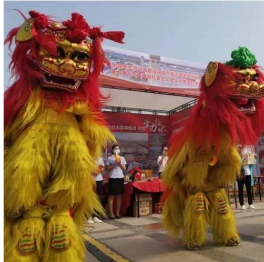
Figure 2: Northern Lion

fully demonstrating the Northern Lion Dance's charm. Overall, the Northern Lion performance is realistic, focusing on imitation. The Northern Lion is prevalent in the regions north of the Yangtze River in our country, with Xushui in Baoding being the birthplace of Northern Lion Dance culture, historically known as the "Ancestor of the Northern Lion" (Yang, Yang, & Sun, 2022). The Southern Lion performance is more abstract, focusing on capturing the spirit, with the Guangdong Lion Dance being a typical representative of the Southern Lion. The Guangdong Lion Dance can be mainly categorized into the following types.