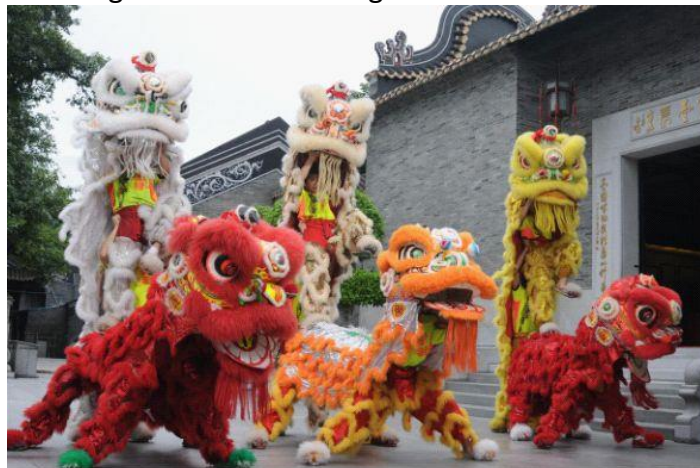
Figure 1: Guangdong Lion Dance Performance (Guangdong Provincial People's Government Local Records Office, 2017, http://dfz.gd.gov.cn/sqyl/fwzwhyc/content/post_1109684.html )