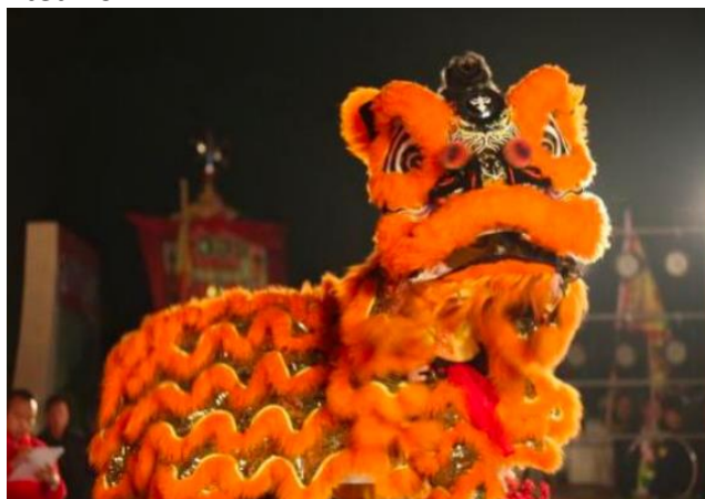
Figure 5: Heshan mounted lion

In recent times, its main forms of performance are the traditional lion dance and the competitive lion dance. In the Guangdong Lion Dance, the lion's form is composed of two dancers: one for the lion's head and the other for the lion's tail. They utilize various steps and