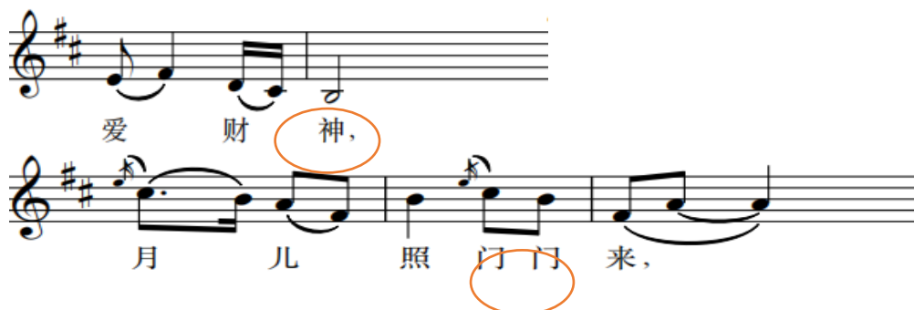
Example 2 "小桃红(Xiao Taohong)"

Shaanxi folk songs, you should pay attention to mastering the diction skills, which will be of great help in grasping the style of northern Shaanxi folk songs.