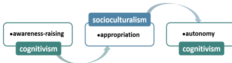
Figure 2: Theories Underlying 3As Approach

Thornbury's (2012) approach to teaching speaking is referred to as the 3As approach (initialism for awareness-raising, appropriation, and autonomy) in this study for ease of use.