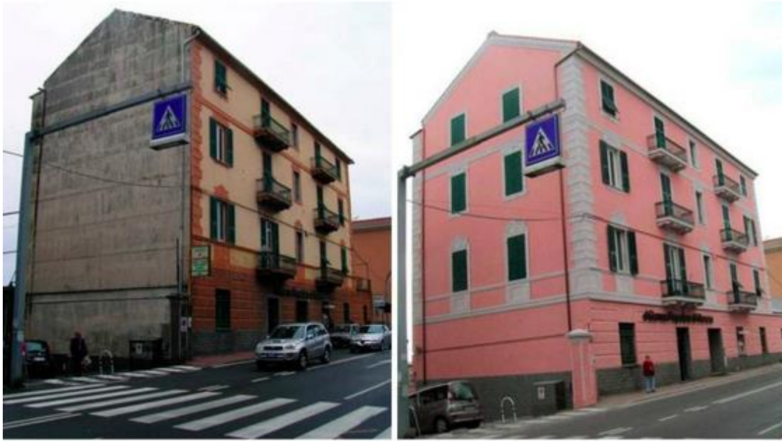
Figure 1: Illustration of a private building in Italy, showcasing its condition before and after undergoing retrofitting in accordance with the EGD EU Directive 2018/844

The retrofitting of private houses refers to upgrading or improving existing residential properties to enhance their energy efficiency, sustainability, and overall performance.