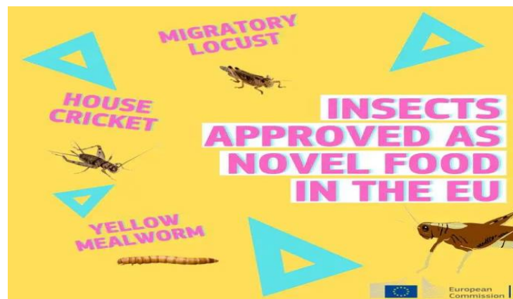
Figure 2: Illustration of a novel food product promoted by the European Union