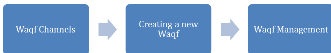
Figure 2: Roles of TBS

The figure above shows the roles of TBS follow the steps. First, they providing the Waqf channels to the people. Second, they creating the new Waqf which is as the result from providing the Waqf channels. More people may interested to give Waqf. Last but not least, the management of Waqf.