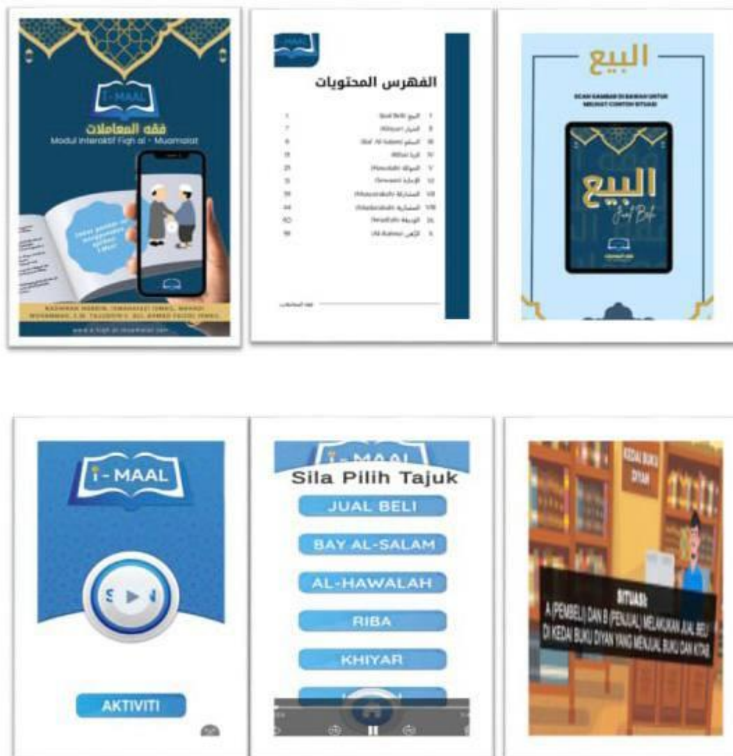
Image 1: A portion of the i-Mall application module using AR scanning.