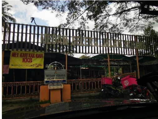
Figure 3: Kak Kiah Shop