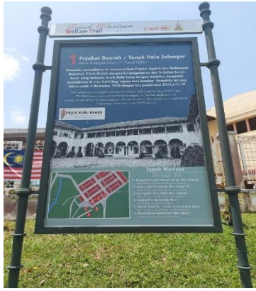
Figure 1: World Heritage Signboard