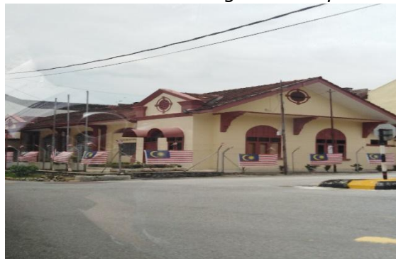
Figure 6: Old Fire Station KKB