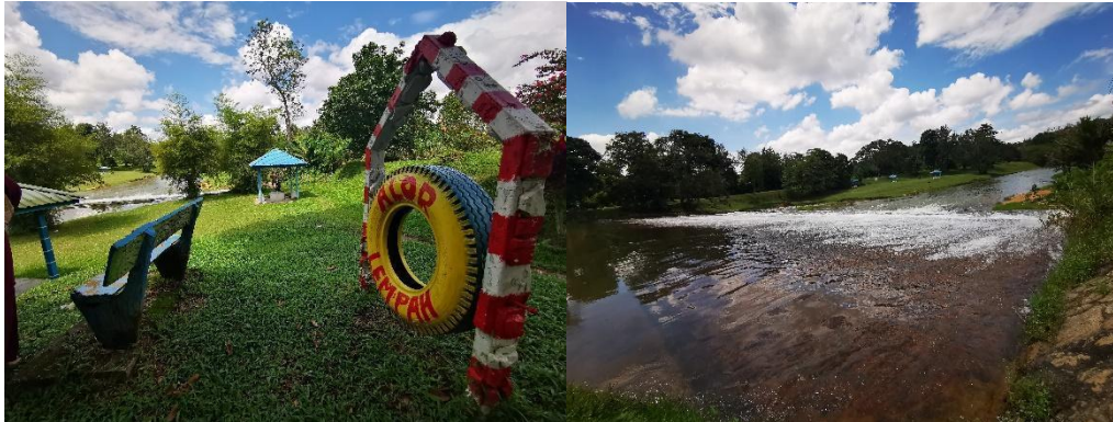
Figure 4: Selangor River

Respondent 8: “Kuala Kubu Bharu, Enjoy the greenery while exploring small Pekan full of protected history, and socializing with friendly locals”