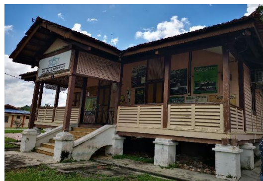
Figure 7: Historical Gallery Kuala Kubu Bharu