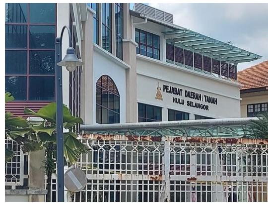
Figure 2: District and Land Office Hulu Selangor