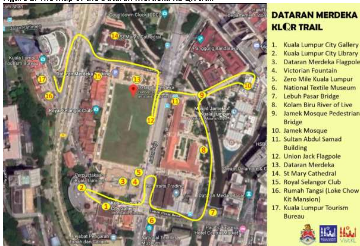
Figure 1: The map of the Dataran Merdeka KL QR trail

Dataran Merdeka KLQR Trail is the initiative taken by the local authorities toward SMART city in Kuala Lumpur. According to the Mayor of Kuala Lumpur for KUALA LUMPUR SMART CITY MASTER PLAN 2021 – 2025, “Kuala Lumpur is beginning to and will continue to integrate technological solutions into local operations, from transportation to communications and other areas including tourism. Under the initiative of a smart economy, the tourism destination will enhance through technology. Therefore, the project KL QR trail is introduced to rationalise this strategy. Additionally, this area consists of various cultural and heritage attractions. The sustainable development goals gallery, located at one of the checkpoints, also highlights the sustainability agenda at this destination. This also showed the importance of sustainability in this Smart city.