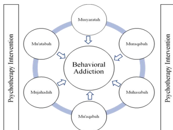
Figure 2: Self-hisbah approach as an Islamic psychotherapy intervention for behavioral addiction

The self-hisbah approach as an Islamic psychotherapy intervention in dealing with behavioral addiction is shown in figure 2