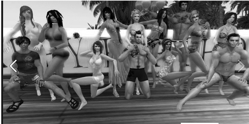
Figure 1: Group photo during the beach party for SL1M family members (posted by one of the resident in SL1M closed Group Facebook)

backgrounds prohibit in the actual world. The allure of engaging in forbidden acts is a major draw for these individuals, who enthusiastically embrace the opportunity to bring their fantasies to life in the virtual domain. Figure 1 is a screenshot that exemplifies some of the forbidden and controversial activities that these residents engage in, further emphasising the irresistible allure of Second Life's unrestricted freedom. Despite the inherent dangers and moral conundrums, SL1M residents continue to use Second Life as a diversion and a platform to fulfil their innermost desires. According to research conducted by Yusof and Ariffin (2021), the participants identified a number of factors that contribute to the desire to escape the actual world. Among these factors are seeking relief from real-world tension, neglecting real-world responsibilities, and developing an obsession with the virtual environment.