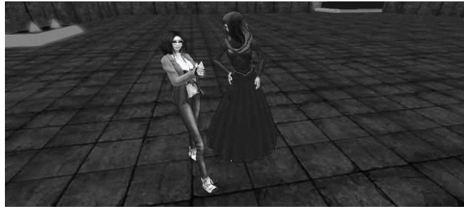
Figure 2: Conversation between researchers' avatar with one of the respondents' avatar before the interview session started.