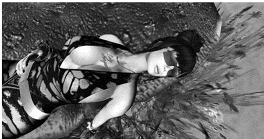
Figure 3: SLM4 is wearing sexy clothes that do not represent her real life

According to the online interview with SLM4, she enjoys wearing provocative clothing in the virtual world of Second Life. Due to her adherence to religious and cultural dress codes, she is unable to manifest this predilection physically, as she wears a headscarf. SLM4 is cognizant of the limitations imposed on her in the real world, and she views Second Life as a means to explore activities that are otherwise inaccessible to her in the real world. She devotes time and resources to augmenting her avatars with various styles and personas that deviate from her genuine self. Figure 3 depicts the metamorphosis of SLM4's avatar, which challenges societal and cultural norms.