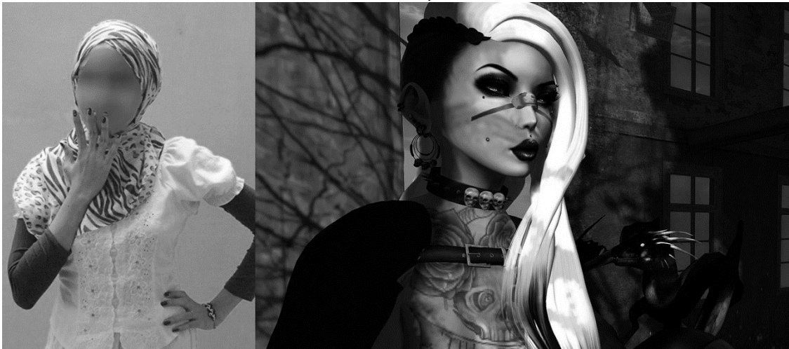
Figure 4: Different personality of SLM1 in her real life and Second Life

According to the passage, SLM1 wished to disclose her gothic identity to the online community, specifically her blog's readers, and establish connections within Second Life. As a result, she found solace in adopting a different persona in the virtual world, which allowed her to authentically express herself, a chance she lacks in real life. Figure 4 illustrates the contrast between her real-world and Second Life personas.