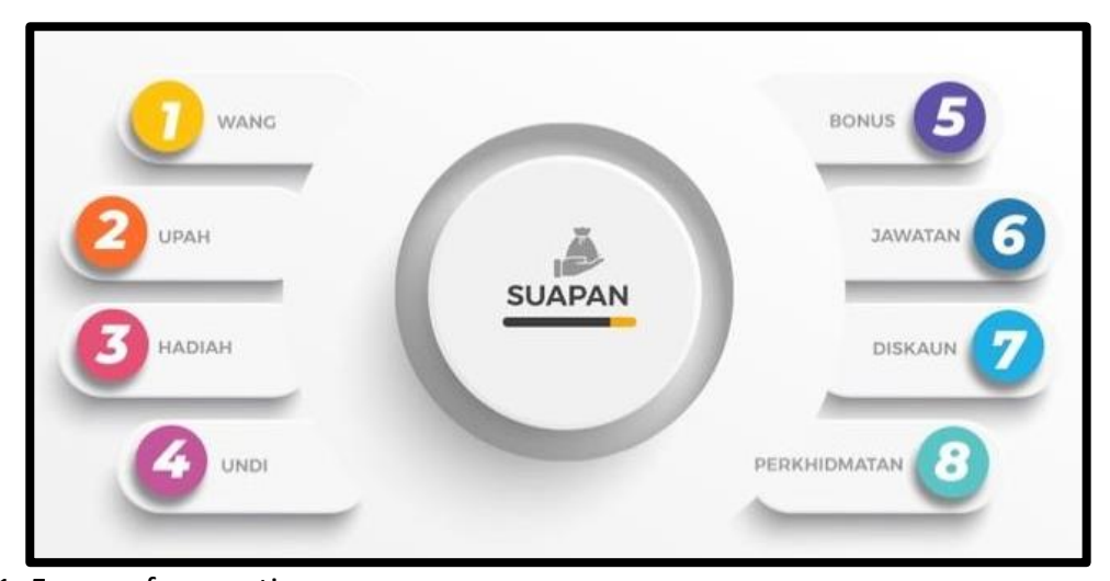
Figure 1: Forms of corruption

According to the Malaysian Anti-Corruption Commission (2022), bribery is defined as an individual accepting or offering something as a reward or encouragement to perform or not perform an act linked to official obligations. Bribery includes money, presents, bonuses, votes, services, positions, salary, and discounts, as seen in Figure 1.