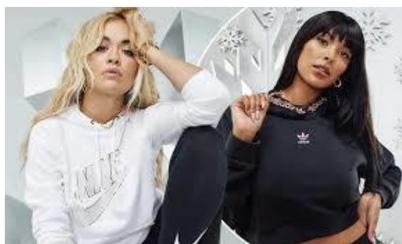
Figure 1 (g)

However, in the Adidas advertisements as shown in Figure 1 (e) and (f), young women were shown where a few were scantily clad and just showed off the sports attire by Adidas. These young women were not shown to be doing anything sports related. They are simply modelling the sports attire.