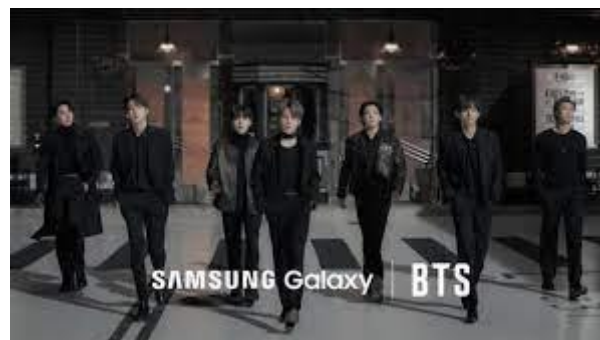
Figure 4 ( b )

In the above advertisement as shown in Figure 4 ( a ), a drab looking woman is shown to be incapable of holding a mobile phone properly. In this advertisement, she fumbles around with her handphone and almost drops it. The rather stereotypical portrayal of a dumb blonde who is careless with her belongings. It is not a flattering portrayal of a woman in the modern world.