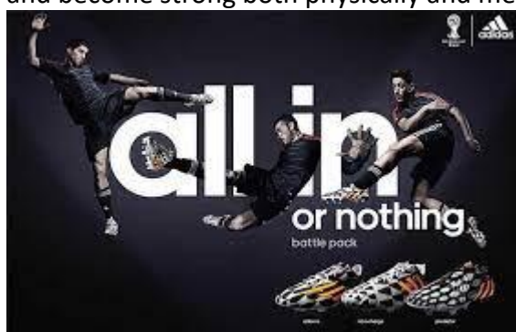
Figure 1 (c)

In Figure 1 (a) and (b), the Nike advertisements showed that women are powerful and are able to do things that men can do such as being involved in sports and entering Olympics. The women are seen to be very capable, not helpless, or weak, strong physically and mentally too as they must overcome social barriers which are traditional. The advertisement show that women have to be mentally strong to overcome traditional mindsets and train themselves to always improve and become strong both physically and mentally.