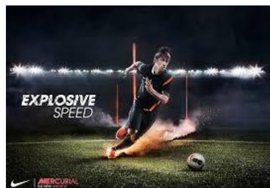
Figure 1 (d)

In the Adidas advertisements as shown in Figure 1 (c) and (d), male athletes were seen in action playing sports. This gives a powerful portrayal of men as being competitive, confident, and strong.