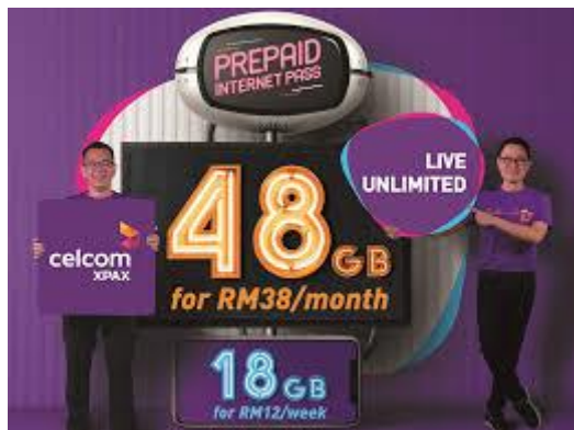
Figure 5 (d)