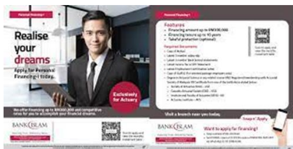
Figure 3 (a)

Designed to provide convenience when opening your staff salary account.