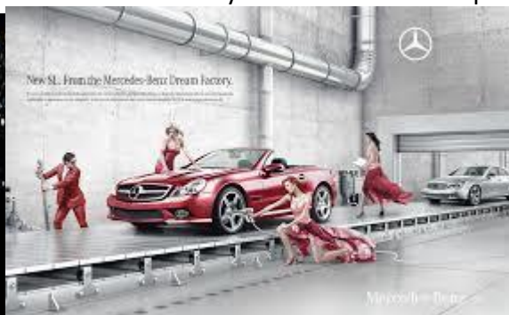
Figure 2 (f)

However, in the Mercedes advertisements above as shown in Figure 2 (e) and (f), scantily clad women were seen standing near the car. In the latter advertisement, 3 women were seen assembling a car in a factory, but they were not decently attired whereas the man standing there was decently attired. This is an obvious sexualized portrayal of women and obviously degrading to women.