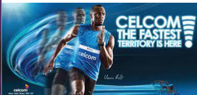
Figure 5 (e)

In the above advertisements as shown in Figure 5 (d), the men were seen standing confidently while in Figure 5 (e) Usain Bolt, an Olympic gold medalist is portrayed as the fastest man in the world and this is compared to the speed of the Celcom Internet coverage. Again, a man is shown in the advertisement to reflect the image of speed, strength, and power.