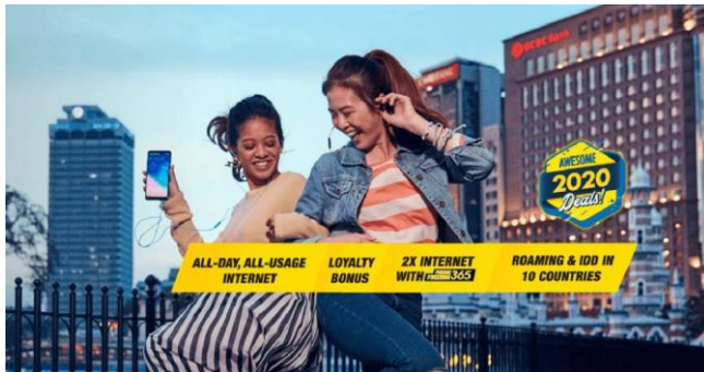
Figure 5 (a)