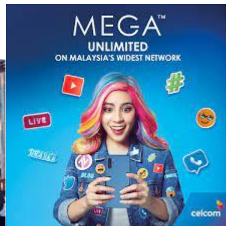
Figure 5 (b)

In the advertisements above, young women were shown to be having fun and in the latter advertisement, a flamboyant looking young woman is seen fixated on her mobile phone. This is not a serious or professional depiction of women in this modern era.