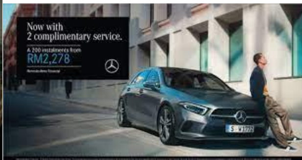
Figure 2 (d)

In the Mercedes advertisements above as shown in both Figure 2 (c) and (d), two men were seen near the cars. These luxurious cars are owned by men as they were considered wealthy and powerful individuals. This luxury car brand uses men to symbolize wealth and power.