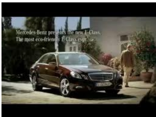
Figure 2 (c)

Tom Hiddleston, a famous actor, was the model in the Jaguar advertisement as shown in Figure 2 (a) and he showed how the car was equipped with many sophisticated and hi-tech features. Only a man was used to highlight the car’s special features because the audience does not associate a powerful, sleek, and modern car with women. In Figure 2 (b), 3 men were shown and in one part of the advertisement, a helicopter is seen hovering near the sleek Jaguar. This gives the impression of power and strength.