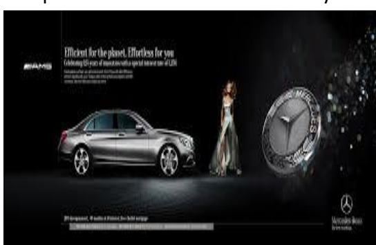
Figure 2 (e)

In the Mercedes advertisements above as shown in both Figure 2 (c) and (d), two men were seen near the cars. These luxurious cars are owned by men as they were considered wealthy and powerful individuals. This luxury car brand uses men to symbolize wealth and power.