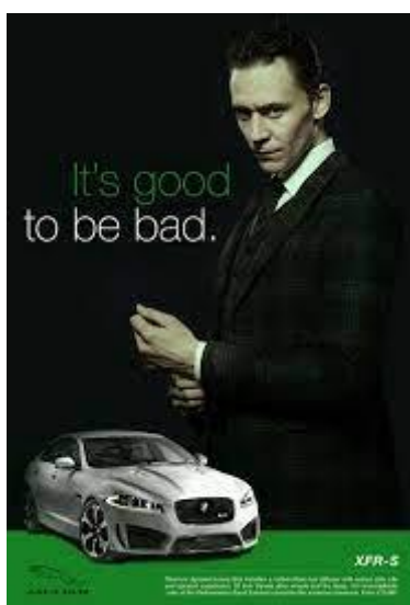
Figure 2 (a)

In addition, as shown in Figure 1 (g) two well-known celebrities, namely Rita Ora and Maya Jama are shown modelling Adidas sports attire. These women are simply modelling the clothes and do not symbolize or represent power or strength whereas in the advertisements where men were portrayed, the men showed great prowess in sports.