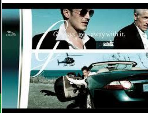
Figure 2 (b)