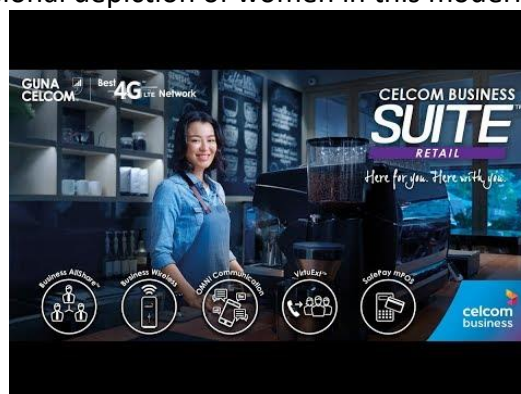
Figure 5 (c)

In the advertisements above, young women were shown to be having fun and in the latter advertisement, a flamboyant looking young woman is seen fixated on her mobile phone. This is not a serious or professional depiction of women in this modern era.