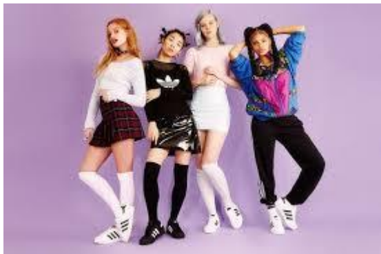
Figure 1 (e)