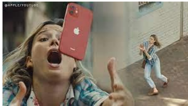
Figure 4 ( a )

In the above advertisement as shown in Figure 4 ( a ), a drab looking woman is shown to be incapable of holding a mobile phone properly. In this advertisement, she fumbles around with her handphone and almost drops it. The rather stereotypical portrayal of a dumb blonde who is careless with her belongings. It is not a flattering portrayal of a woman in the modern world.