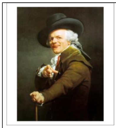
Figure 1: Personal Portrait of Joseph Ducreux

instance, through the medium known as memes. Several pieces of information can be produced using interesting pictures or images to attract someone's attention. According to Hadzman (2021), some accounts on social media prefer to use images of beautiful women and handsome men for attracting readers' attention. This situation clearly shows that images and pictures can give a certain effect on the audience and readers owing to their ability to convey different meanings and allow each individual to express each image that is viewed based on their understanding of the image. This situation can be referred to as the content of information in the form of memes. According to Bradley and Bret (2014), a meme can refer to a photo that has been edited from someone's original photo, for example, a portrait of Joseph Ducreux, a French painter. He was born in 1735 and is well known for his paintings. In 1793, he managed to complete his own portrait as can be seen in Figure 1. The resulting portrait shows him wearing brown clothes and a black hat. In addition, the portrait also portrays him smiling while pointing towards the position in front of him.