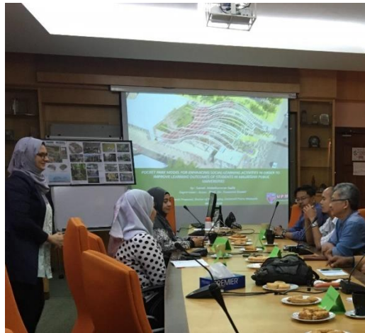
Figure 1 Focus Group Discussion on 10th March 2020, UPM