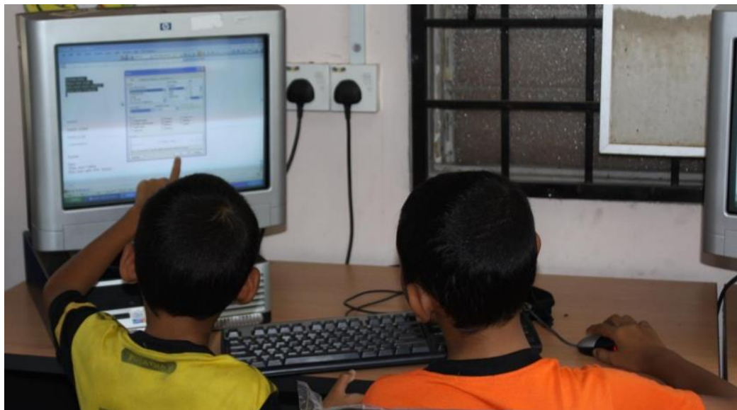
Fig. 4. Orang Asli students used computer to complete assigned task

R7: It’s difficult for me to understand what has been taught, because no exposure with the utilization of devices before”.