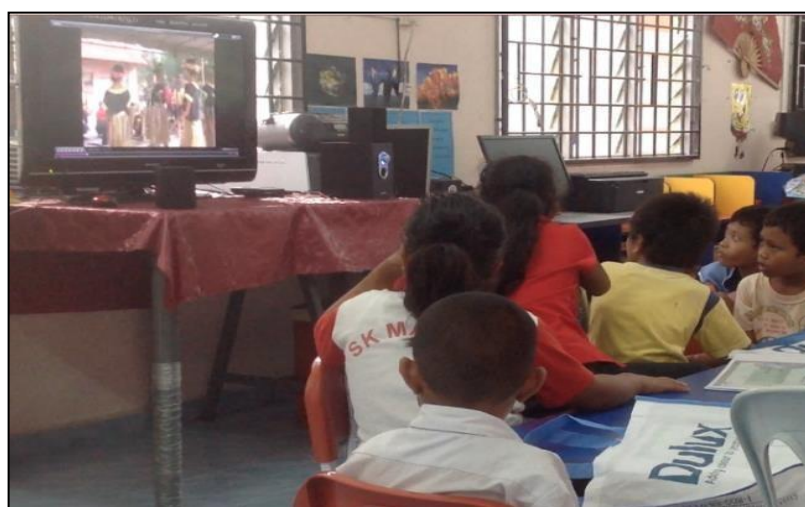
Fig. 3. Orang Asli students watch Orang Asli community traditional dance

Fig. 3 shows the integration of video in teaching and learning processes, which include the Orang Asli community's traditional dance. The selection of Orang Asli community's traditional dance to be imbedded in the T&L material is to relate to their culture and ensure that they are able to understand it well. For the Orang Asli community, culture plays an important role in their lives. Therefore, the infusion of their culture into T&L was able to attract them to learn better.