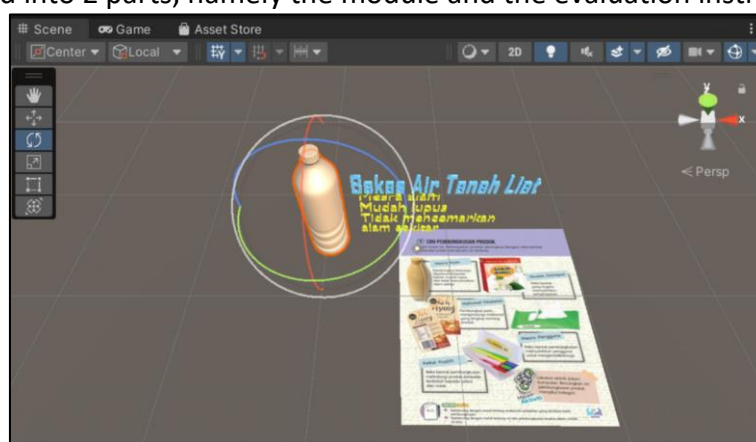
Figure 1: RBT textbook page 58

In this phase, an educational application based on augmented reality has been designed to be included in a module that will be used by teachers. The researchers will design and develop an AR module suggested by expert's view and also guided by the needs analysis data that has been implemented. Teachers only need to download the Unity AR application on a mobile device, get a marker on page 58, RBT Year 4 textbook (as shown in Figure 1) and internet requirements. Therefore, to see the results of the AR content, the teacher needs to scan the pictures found in the Year 4 RBT textbook. The process of designing and developing this module is divided into 2 parts, namely the module and the evaluation instrument.