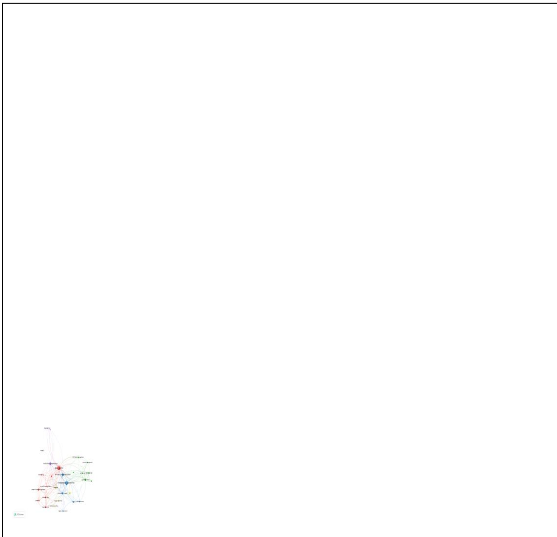
Figure 3 Author keywords visualization