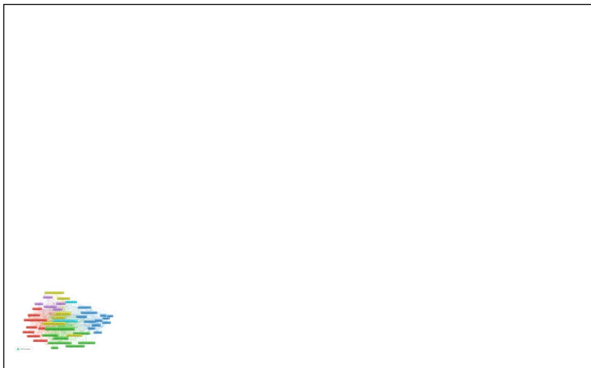
Figure 4 The network visualization of terms co-occurrence based on the title and abstract.

Universities or higher educations may face serious challenges in raising awareness of institutional repositories. Institutional repositories are made specifically to preserve, arrange, and make accessible the research materials and intellectual output that are created by faculty, researchers, and students at learning institution. Libraries as service provider may improve the effect and exposure of their institutional repositories, which will eventually benefit the institution and the larger research community, by addressing these awareness concerns and actively interacting with the academic community.