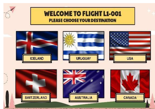
Figure 2: Flags page