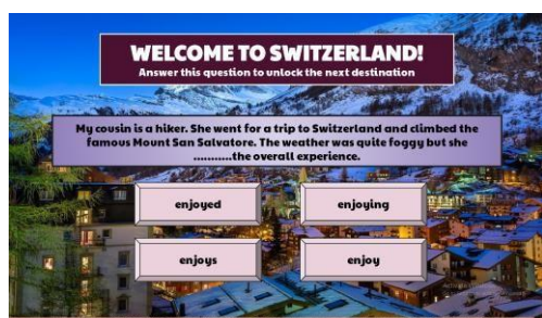
Figure 3: Sample question