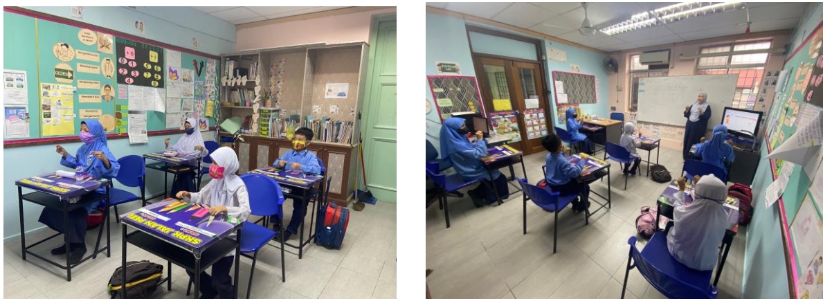
Figure 3. Activities done in the classroom

During the lesson as shown in Figure 3, pupils are guided to read by signing along with the teacher. This is to ensure that the pupils were really engaged with the lesson. The teacher also made sure that the pupils repetitively sign correctly based on the shown vocabulary. Following the introduction of the vocabulary, the researcher carried out the implementation of the innovation material as an assessment tool and a part of the lesson activity.