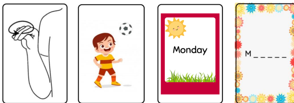
Figure 1: Example of Language Skills Activities

Using a qualitative method, this research was conducted towards four intermediate level Year 3 hearing-impaired pupils. The purpose of this study is to observe the effectiveness of the vocabulary lesson that was carried out by implementing the 'Go Fish English Game' as an activity to assess the pupils' comprehension level after the lesson. The researcher started off the study by identifying the most common problem occurring in English vocabulary language teaching and learning which is the ability to associate the word with the object. This is especially hard for hearing-impaired pupils due to their inability of associating the word through sounds and totally relying on visual aids and materials. The card game also assesses the pupils using all four main language skills in order to thoroughly reflect the pupils' understanding regarding the topic.