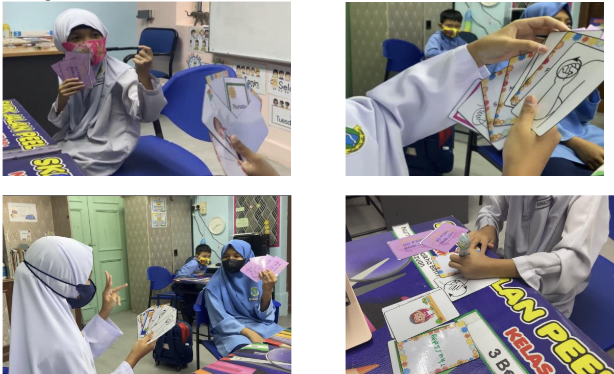
Figure 4. Activities played by the students

The results of the study were analyzed using thematic analysis that was collected through observation and interview from four hearing-impaired Year 3 pupils. The researcher chose this approach since it is easier to summarize the key features and provide qualitative insights. Since all the pupils are in the intermediate level of English proficiency, the researcher is able to classify the themes as follows