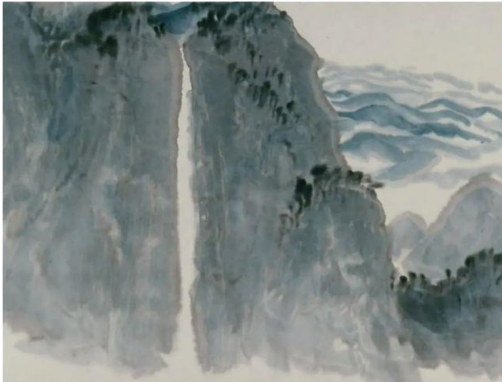
Figure 2. Stills of "Mu Di"