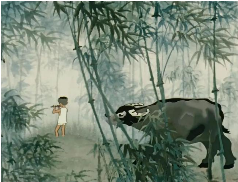
Fig. 1 Figure 1. Stills of "Mu Di"

The Taoist perspective on language provides a valuable outlook for today's society. Emphasizing harmonious coexistence between humans and nature underscores a people-orientated approach in education and respects the natural growth patterns of individuals. When it comes to interpersonal interactions and self, The Taoist culture encourages self-reconciliation and reconciliation with the world. With the changing times, many new opportunities have emerged, and the research of integrating Taoist culture into new artistic domains has begun to take root. This evolution aligns with the pace of the era. (Jin'e,2023)