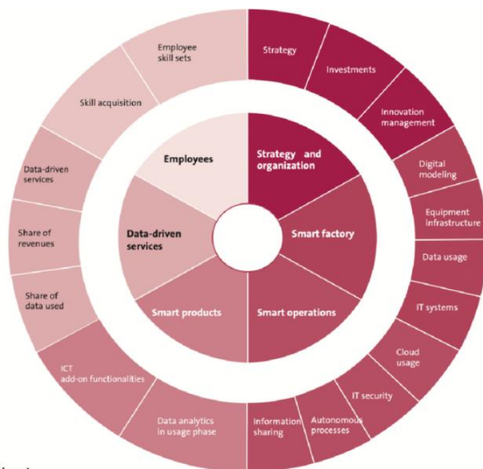
Figure .1 Impuls Model (Lichtblau, 2015)

IR 4.0 can only be successful depending on various factors. Based on Impuls model (Lichtblau, 2015) six factors contribute to of the success of IR 4.0 adoption; employees, strategy and organization, smart factory, smart operations, smart products and data-driven services.