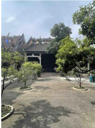
Fig. 1. Chen Clan Academy environment.

Architectural decoration exists in a certain natural environment. The difference of natural environment in different regions usually leads to the different characteristics of architectural decoration in form, color and material expression. Guangfu residential architectural decoration has undergone a complex environmental evolution and spiritual refining, which is the product of long-term interaction, penetration and combination of various factors. The geographical environment gave birth to the Guangfu culture. The residential decoration culture of Guangfu was also influenced by many factors, such as the geographical climate environment and the humanistic tradition, and was deeply marked by the natural environment of Guangfu. Natural environmental factors play an important role in the regional characteristics of architecture.