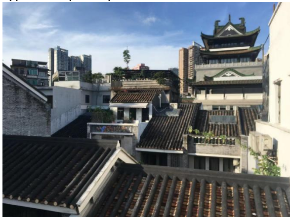
Fig. 3. Guangzhou Xiguan architecture roof.

customers can buy goods along the arcade. Arcade building architectural decoration style, there are imitation Roman, imitation Gothic, imitation Renaissance, imitation Baroque, imitation classicism, southern style, Chicago school style, modern style, and Chinese traditional style. In Guangfu, these styles of shophouses can be seen. The Imitation Style is because the residence has been localized after entering the Guangfu. It is to add the original style to the arcade building, with the ground floor raised, and the details with some Chinese decoration or to add symbols of other styles into one style, rather than pure imitation. Another example is Xiguan Big house residence. The eaves of the house are deliberately slanted to help rain tilt. The roof tiles use plaster as an adhesive to achieve the effect of typhoon - proof practical decoration.