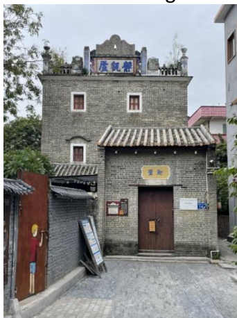
Figure 7. Jingguan Residential, built with the sloping roof of Guangfu (Source: Author's own photo).