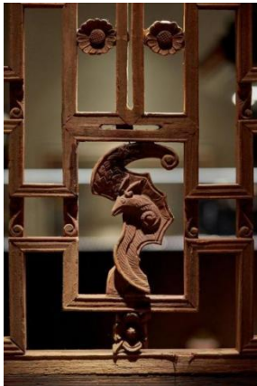
Figure 6: The bat decoration on a window

Through the architectural space logic, the decorative design techniques are used purposefully to strengthen these architectural functions by using structure, structure and materials. The symbolic decoration style does not interfere with the spatial content of the Guangfu residential buildings. It is parasitic on the architectural structure or non-structural components, and transmits symbols and meanings through various themes, giving the buildings life and power. Architectural decoration, as an art, is perceptual, while the structure often has the characteristics of rationality. When the structure and form are integrated because of architectural decoration, the decorative style actually has the dual characteristics of rationality and sensibility. Bats in China represent happiness; so the Chinese people use the bat decoration to decorate their windows.