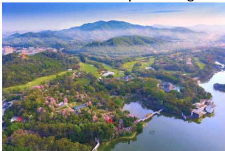
Fig. 2. Lingnan environment.

In the historical development process of Lingnan architecture, these natural factors, especially related to temperature, sunshine, precipitation, monsoon direction and others to mention. The unique natural environment of Lingnan with the mountain back and the sea face has a great impact on the architectural design of Guangfu area. Therefore, the buildings in Guangfu area have unique features in dealing with these climatic factors, such as expanding the inclination angle of the eaves of buildings, which is conducive to the rapid rain pouring. This also encourage the use of plaster as an adhesive to hold the roof tiles in place in case of typhoons. Unique Guangfu arcade building, the building can block the summer strong sunshine and showers, convenient for business activities and pedestrians to go out. The streets of Guangfu House are arranged in a comb style, using cold alleys for ventilation and cooling. These technical treatment techniques are gradually formed to adapt to the natural environment and climate characteristics of Lingnan region, thus shaping the characteristics of traditional architecture of Guangfu different from other regional architecture. It also has a unique influence on the decorative design form and style of Guangfu residential buildings. We will focus on and study the unique natural environment of Guangfu as an important content of interior space design.