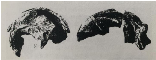
Fig. 4. Skull of Maba Man.

Since the Song Dynasty, handicraft skills in Guangfu area began to develop, and the productivity of residential building decoration was constantly improving. The pattern, shape, function and decoration technology of doors, Windows, columns, roofs and frames in residential building decoration have also been greatly developed. In addition, due to the favorable geographical environment and natural climate in the middle period of the Qing Dynasty, the development of agriculture in Guangfu accelerated, and the trade volume of agricultural products also increased year by year, gradually driving the comprehensive development of commodity economy in the region.