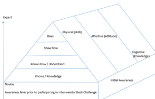
Figure 2: Proposed research framework for stock trading simulation adapted from The Miller Pyramid and Prism

The initial awareness of participants is captured through a questionnaire prior to their registration to participate in the stock challenge. Participants were encouraged to attend a series of workshops throughout the stock challenge so as to gain stock trading literacy with regards to the three dimensions: cognitive, affective and physical. The perceptions of these three dimensions in stock trading literacy can then be captured in the questionnaire. A set of four null hypotheses stated in the purpose of study section were formulated from the proposed research framework to guide this research.