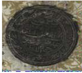
Figure 2: The seal used in Letters from Sultan Mahmud Riayat Syah from the state of Johor and Pahang was addressed to Governor-General Willem Arnold Alting dated 12 Ramadan 1211 or March 11, 1797.