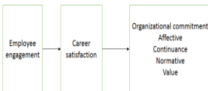
Figure 1: Conceptual framework of the model

This study suggests that based on the logic underlying the social exchange theory and based on the trends of the empirical review in relation to the variables considered in this research, employee engagement positively impact organizational commitment. Also, career satisfaction will play a mediation role in the relationship between employee engagement and organizational commitment.