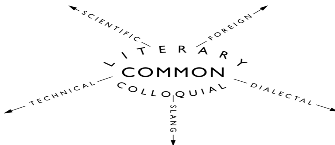
Figure 1: English Lexical Items according to The Shorter Oxford English Dictionary (SOED)

Another way of looking into words form lexis is the word in use. This is also refers to register approach lexicon based forms. Based on this classification words are classified into standard and non-standard lexical items. Looking at this from another angle, words in Oxford English Dictionary are categorised into central and the peripheral lexical items.