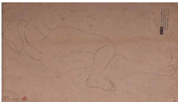
Fig. 2. A Female Body Lying on Her Side , 1937, line drawing, with Chen Duxiu's inscription, Anhui Provincial Museum.

Chen Duxiu used his influence in the cultural field to write articles on Pan's work, serving to enhance her reputation. Chen Duxiu wrote an inscription on three of Pan's human body paintings, in which he praised the works and gave her method a distinguished character and categorical definition: "Using the technique of European sculpture, combined with Chinese line drawing, I call it New Line Drawing" (Dong, 2013:174), (See Fig. 2).