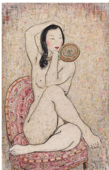
Fig.3. Seated Nude Holding a Mirror , ink and color on paper, 1956.

positive way, as has been my primary focus, but also consideration needs to be given as to whether certain aspects of the 'orientalist' influences served to fall into the trap of depicting women of the eastern hemisphere - the so-called 'orient' - as enigmatic play things, based on the mentalities of 'occidental' male fantasies, thus failing to depict with women of the East as conscious agents. (See Fig. 3).