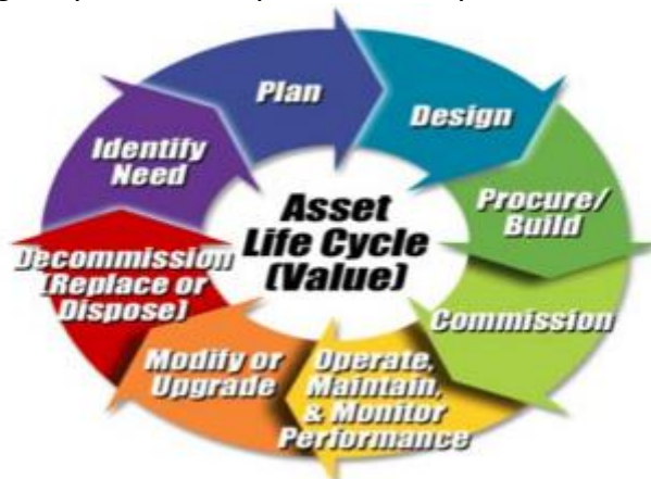
Figure 1: Asset life cycle

In order to achieve cost effective management control of a capital asset it would be helpful to have an asset management control system (AMCS) than can be applicable to any organization, to manage any asset, in any of their life cycles.