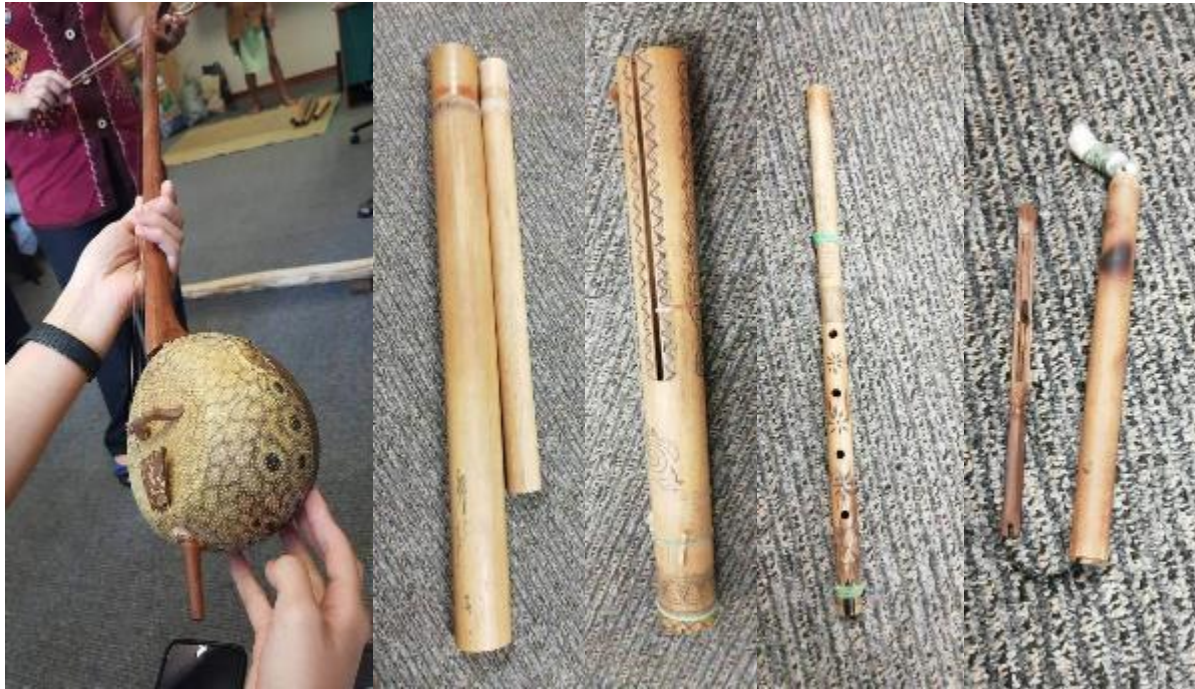
Figure 6: Semai Indigenous Music Instruments