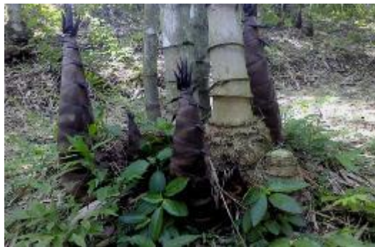
Figure 3: Bamboo Shoot