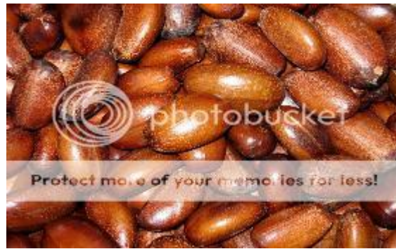
Figure 5: Perah Fruits

The researcher also found that Orang Asli IKG in food does not involve modern technology barks, poisoners or chemicals in food industries. Most of the tribes no longer utilize indigenous practices in food for consumptions due to modernization and development. Back then, they fully utilized the natural resource to survive and managed to live happily without any excuses. According to Bashkar et al., (2015), the traditional food of Orang Asli is based on their traditional wisdom, knowledge, practices, and technologies of the tribes. This IKG can help the plants to grow without using modern technology and can be as a source of protein for healthy living style.