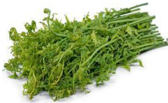
Figure 4: Fern Spikes