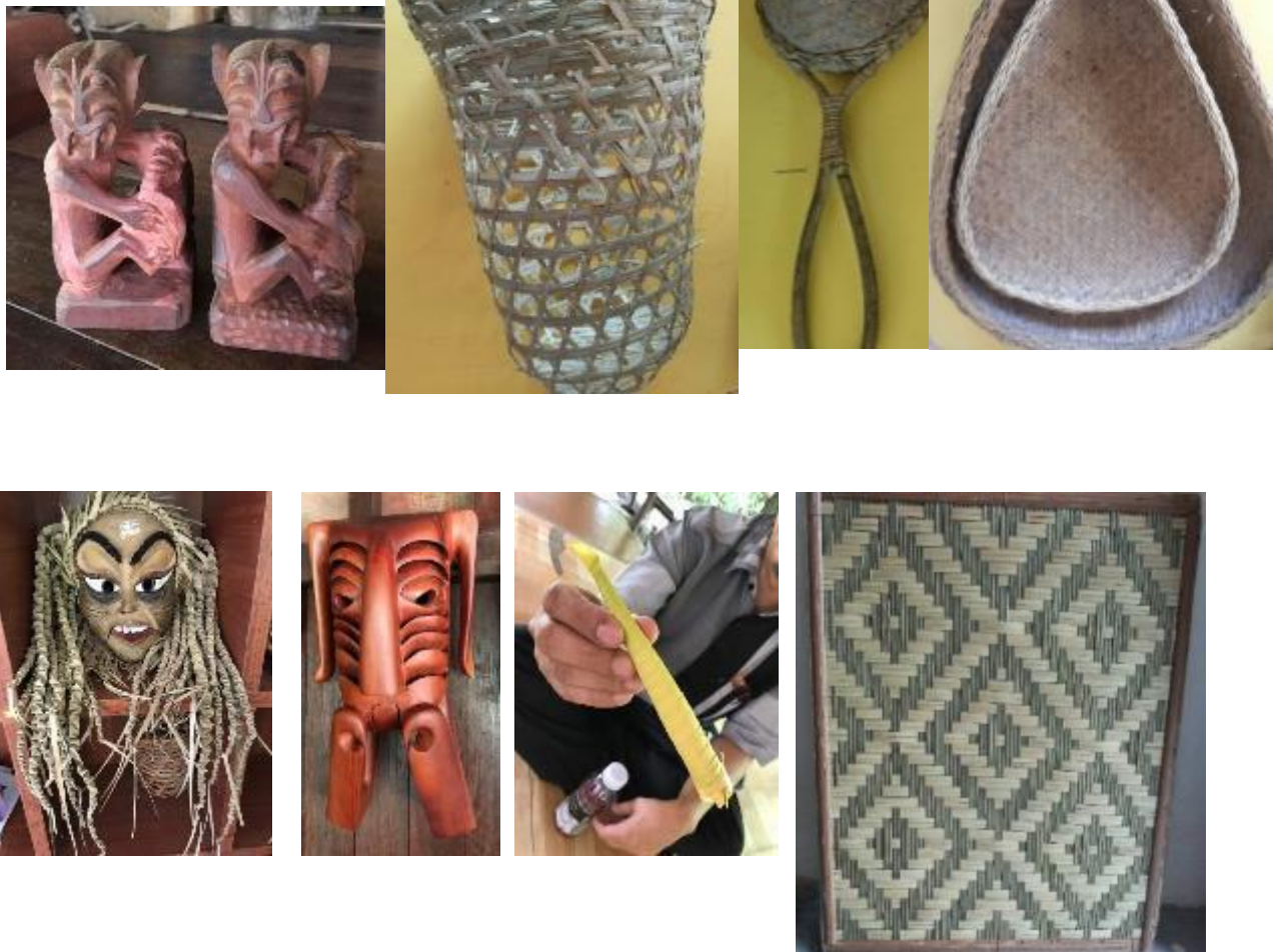
Figure 1: Temuan Indigenous Handicraft

There are only twelve types of handicrafts recorded and found from the tribes of i) Semai located at Raub, Pahang, ii) Mah Meri at Pulau Carey and iii) Temuan which is situated at Rawang, Selangor (refer to Figure 1, Figure 2 and Figure 3). Based on the findings of this study, the Mah Meri tribe nominated the indigenous handicraft such as wooden sculptures, shell decorations, jewellery craft, and wall weaving. In Pahang, Semai tribes' lifestyles are directly associated with the forest and they possess their own distinctive thoughts on the forest resources. They used weaved bamboo, rattan or Nipah as roof and wall decorations of the house. Meanwhile, the Temuan tribes situated in Selangor also have their own uniqueness and diversities of handicraft that are synonym with the natural environment in terms of conserving the sustainability of the environment.