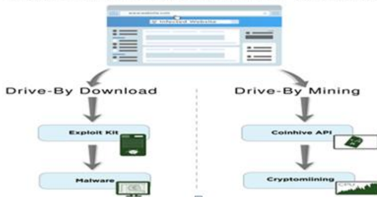
Figure 2: Cryptojacking infection methods

From the way we understand crypto jacking it is the utilisation of victim's electronic resources without the consent of the user and leverage the processing power and graphical power (CPU&GPU) to mine cryptocurrency, there are two known methods adopted by cybercriminals in Cryptojacking. The following figure illustrates the process of Cryptojacking methods.