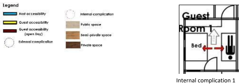
Figure 2. Inventory map on Cikgu Garden Chalet, Kota Bharu