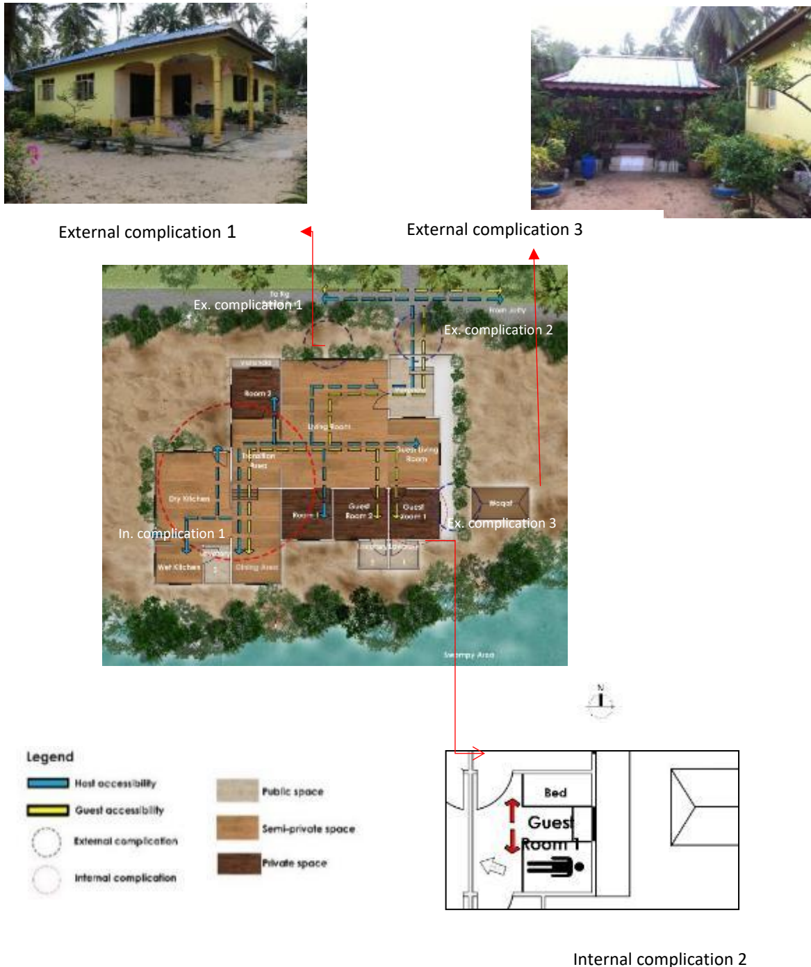
Figure 1: Inventory map on Kg. Pantai Suri, Tumpat