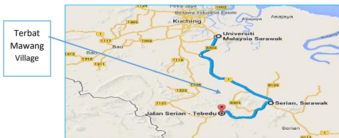
Figure 1.2: Tagang project location sketches

Figure 1.1: Map of Terbat Mawang Village, Serian.