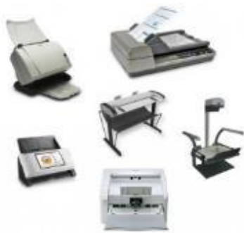
Figure 1: Scanning hardware