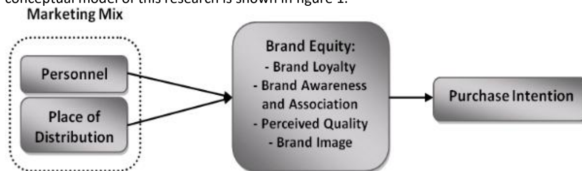
Figure 1: Research Conceptual Model

Considering available theoretical literature in the study and mentioned hypotheses, the conceptual model of this research is shown in figure 1.