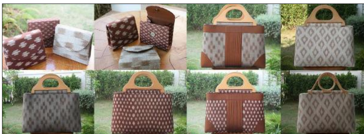
Figure 4. Innovative products made from traditional mat-mee silk textiles.

Most of the silk threads used in production are starting to shift back to locally produced threads and is mixed with purchased threads from factories according to client orders. Natural dyes still continue to be used but many producers now prefer synthetic pigments, but the deciding factor depends on the clients orders. The integration of traditional raw materials with synthetics affiliates in lowering the amount of time spent on production but sometimes traditional and natural materials are chosen due to the fact that some clients prefer organic and chemical free materials. This is reflected in traditional silk textiles that use traditional methods and natural substances (Holland, C. and Others, 2007). The process of transforming silk textiles into products such as silk handbags and wallets (Figure 4) is an important factor that contributes to successful conservation and development of silk textile production.