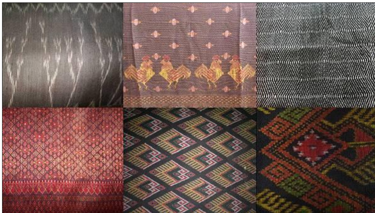
Figure 3. Unique patterns among silk textile producers in the province of Khon Kaen.

The conservation and development of silk textile patterns to create added value in Khon Kaen can be achieved through innovation but must adhere and be modeled after the groups traditional background. The developed textiles must conform to tradition but also meet the demands of clients. Consideration must also be emphasized in product diversity so that there is distinction and uniqueness from other producers. Weaving silk textiles is a very important process and determines relationships within the community which is an addition to the community's social and cultural capital (Hawanon and Rattanarotsakun, 2006). The tools used in silk production still have the same traditional functions but have been improved and been modified with technology. The need to make innovations is required and is a method of conservation where unreliable tools and materials are replaced with more efficient materials and processes (Chunkao 1993). These modifications provided producers with efficiency, increased production, time savings and reduced the resources that were traditionally needed.