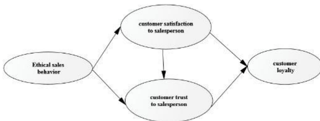
Figure 1- Conceptual Framework

H5: Customer trust has a significant effect on customer loyalty.