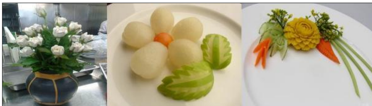
Figure 4. Fruits and Vegetable carving competition.