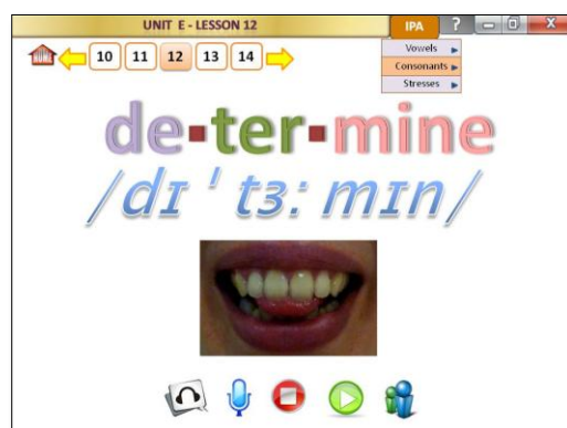
Figure 4. Text + Sound + Mouth Movements + Phonetic Symbols (TSMMPs)