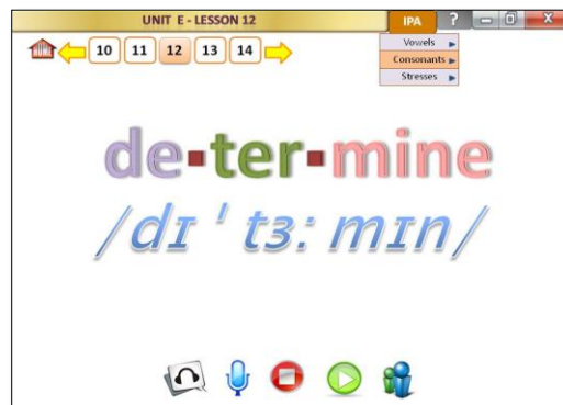
Figure 3. Text + Sound + Phonetic Symbols (TSPS)