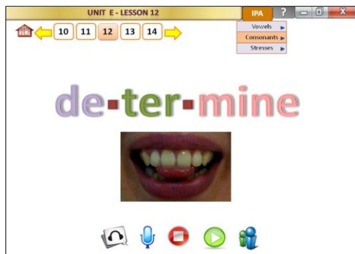
Figure 2. Text + Sound + Mouth Movements (TSMM)