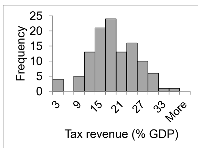
Figure 2: Histogram of the variable TAX_REVENUE