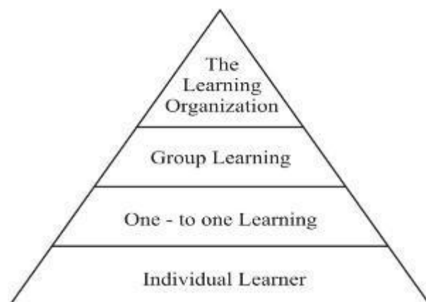
Figure (1): Adapted from Mumford, 1995-Pyramid for a Learning Organization

In fig (1) , a pyramid that is a path of an organization to become LO (Mumford, 1995) is given. According to the above pyramid, LO came into existence when an individual learns, then two individuals learn together and share their knowledge; then ultimately group learning comes which will automatically result in the learning organization (Mumford, 1995).