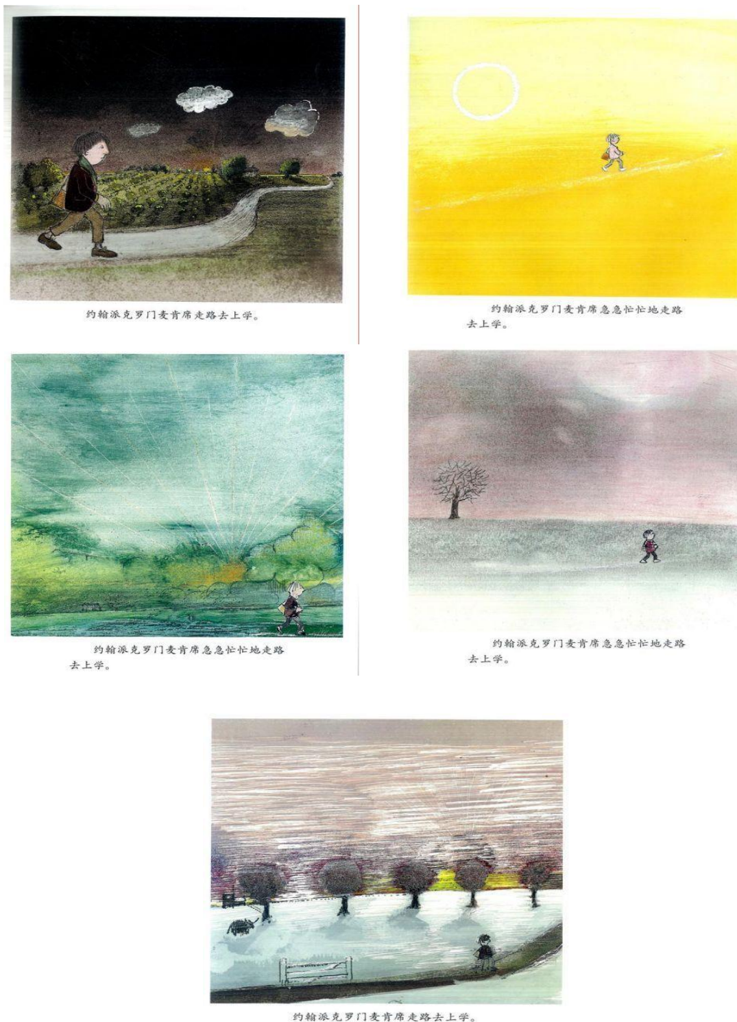
Figure 1. Pages from Chi Dao Da Wang when the boy goes to school (in chronological order)

Although both picture books are about the same theme, the different characterizations can convey different emotions and atmospheres, which can also lead to their different story styles. The choice of characters has a wonderful effect on the expression of the story, and picture books are better at expressing this than general text books, because pictures can give children the most intuitive impressions, and they act directly on children's vision without too much textual description, and present children with a continuous picture that can be felt and seen. At the same time, children's picture books have exaggerated characteristics, such as the