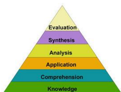
Figure 1: Design of Bloom's Taxonomy

Bloom's Taxonomy outlines six hierarchical levels (Fig. 1) of cognitive complexity: knowledge, comprehension, application, analysis, synthesis, and evaluation. Each category represents an increasingly complex type of cognition that is sometimes referred to as lower and higher levels of learning. Each taxonomy component builds on the successful completion of the previous levels.