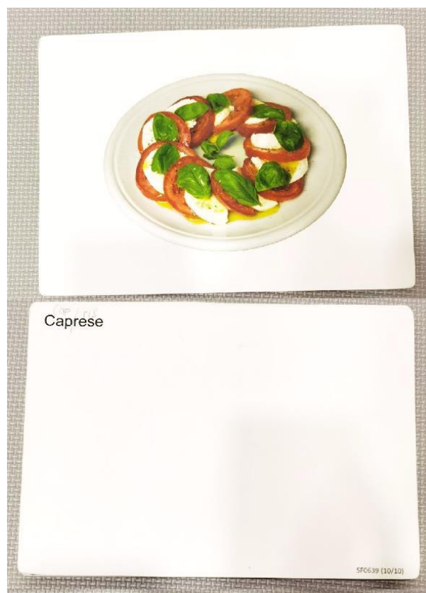
Figure 5 Front (card at the top) and back (card at the bottom) of SENSEI's flashcards