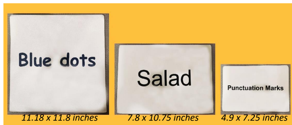
Figure 4 Flashcards used by SENSEI