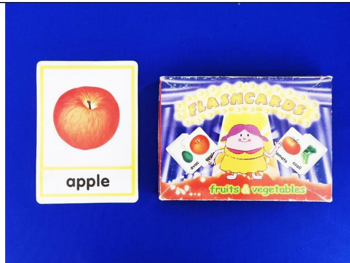
Figure 2 Flashcards used by CIKGU

“... Here is the size of the flashcards that this preschool used, some of them are in A6, some bigger than that...”