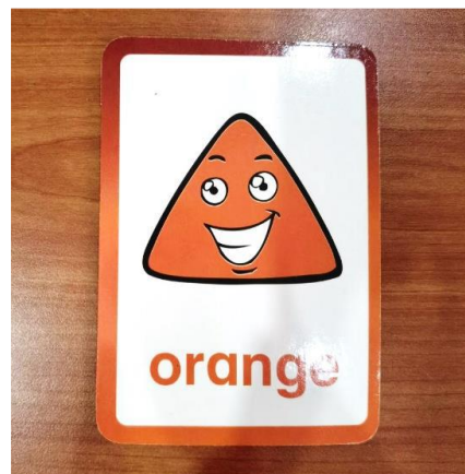
Figure 3 Flashcards used by TEACHER

“...For flashcards, it comes in three different sizes: big card, medium card, and small card. All these have different measurement. The big one is 11.18 x 11.8 inches, the size of the medium is 7.8 x 10.75 inches, and the small one is 4.9 x 7.25 inches...”