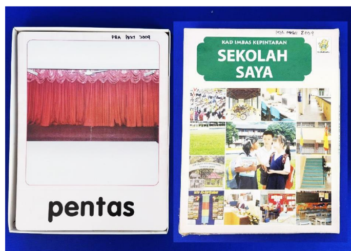
Figure 1 Flashcards provided by MOE to CIKGU