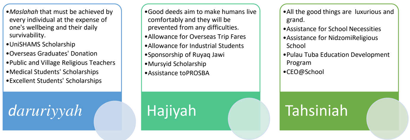
Diagram 1: The distribution of education zakat in LZNK According to the Maslahah

Apart from that, LZNK has targeted an allocation of RM2,500,000.00 in 2019 for Nidzomi Religious School (Lembaga Zakat Negeri Kedah, 2019). The aim is to prepare better infrastructure facilities to the school. The school environment will be more cheerful with this scheme. The deteriorating conditions of the school buildings and student hostels can be upgraded with more modern facilities. According to al-Salam (t.t.), owning beautiful and comfortable accommodation is also included in maslahah tahsiniyyah .