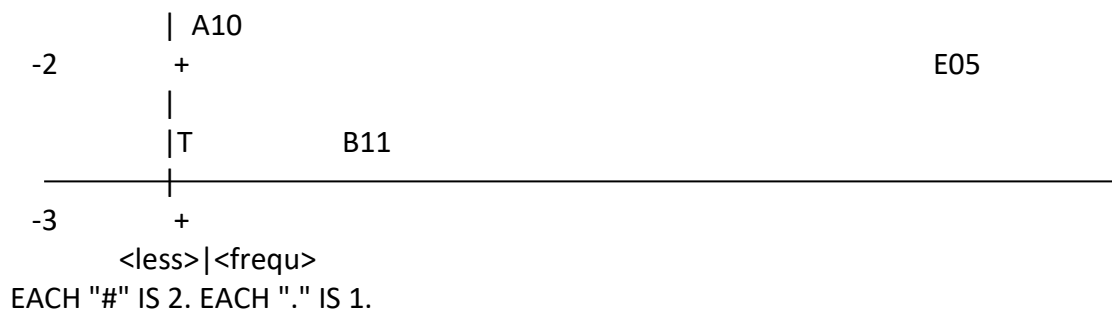
Figure 1. Wright Map Item Distribution and Respondents' Ability in the Teaching Supervision in Culinary Field Study

The final findings of the study at the validation stage for the five constructs of food preparation and serving instruments showed item reliability index of 0.97 and respondent reliability of 0.81 then this study instrument is acceptable, high and excellent in parallel as suggested by Bond and Fox (2015). This indicates that in general the Food Preparation and Presentation instruments are consistent and stable when administered on other samples that have similar and almost identical characteristics.