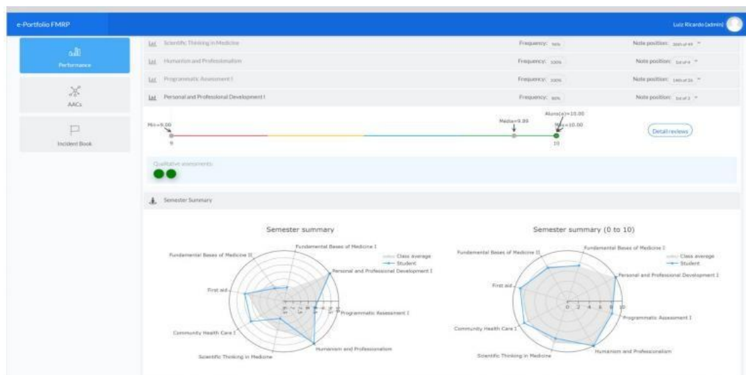
Diagram 2: Student's performance in various subjects is presented in relation to the radar chart: the blue line represents a comparison with the cohort mean (depicted by the gray area).

The advantage of electronic portfolio is that it can overcome the deficiency of core competitiveness by attracting learners and motivating students to learn. The use of similar tools has been recognized for stimulating personal reflection, fostering collaboration, and strengthening digital literacy among students, encouraging active participation in the learning process (Mudau & Modise, 2022).