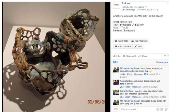
Figure 1: Facebook Post, Symbiosis of Butterfly (2015), by Izman Apis