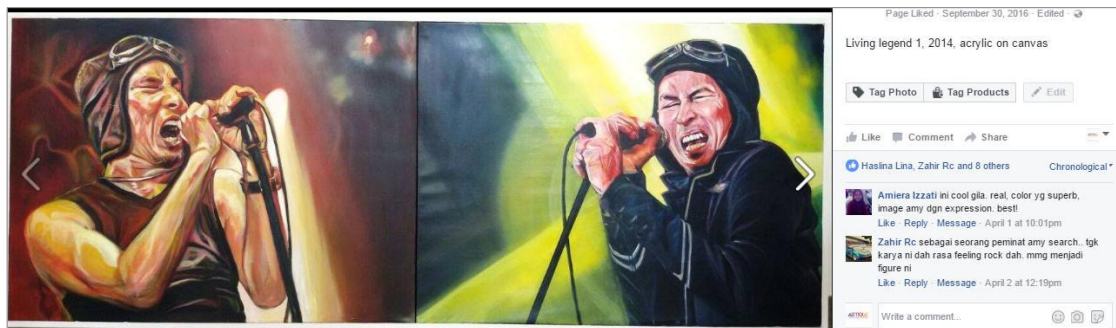
Figure 2: Facebook Post, Living Legend 1 (2014), by Nur Fasihah